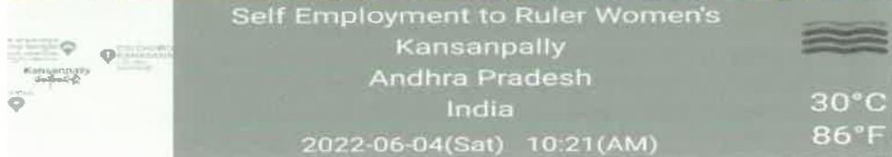
Volunteer giving some instructions regarding self-employment